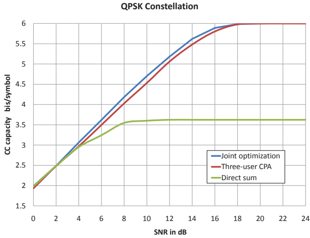
Fig. 3. CC capacity of QPSK constellation with identical average power constraint.

three-user GMAC with finite input constellations. We assume identical average power constraint, QPSK input constellations and \sigma^2 = 1 for all users. Thus, P_1 = P_2 = P_3 and \text{SNR} = P_1 . The optimal \alpha_1 , \alpha_2 and \theta_1 , \theta_2 that maximally enlarge the three-user CC capacity region are obtained as follows. The values of \alpha_1 and \alpha_2 are varied in steps of 0.01 in their search area. For \theta_1 and \theta_2 , search steps are 1^\circ .